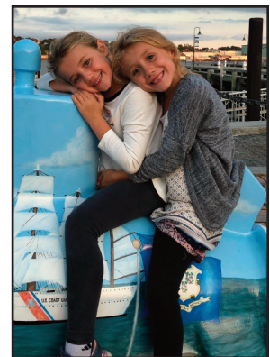
Thankfully, we have family in Connecticut, so I'll be able to see my girls a few times while I'm away.

I'm sure most of you have more traditional holiday plans, hopefully spending time with your own families, eating good food, relaxing, maybe even traveling a bit. Whatever your plans, I wish you a joyous and memorable holiday season!