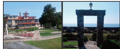
Enders Island is full of beautiful brickwork, architecture, gardens, and grounds.

I had a tremendous brush with fame on the third day that I am compelled to share with you. Wally Lamb, the author of She's Come Undone , I Know This Much is True , We are Water , and several other novels, came to host a craft seminar with us. This was a Q&A session where we were encouraged to ask him about his writing process. He shared many stories; specifically, he spoke about his practice of writing ( cont'd on p.3 )