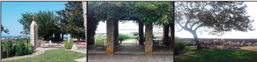
Enders Island is owned by the Jesuits. It is used for retreats for priests, rehabilitation for those struggling with addiction, and other religious retreat experiences. Because Fairfield is a Jesuit school, they have unique access to this gorgeous space to inspire their students to write.

Overall, Enders was an amazing experience, and for the rest of the semester I am working independently under the tutelage of a faculty mentor. I will keep you apprised of my progress!