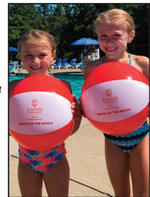
Above, my girls pose with some of their new Fairfield swag! They're so proud of their mom for going back to school!