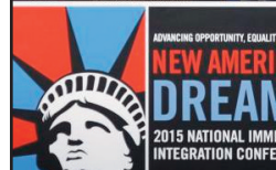
Hillary Clinton takes the stage at the NIIC, delivering a speech based on the premise that America was built by the hands of immigrants.