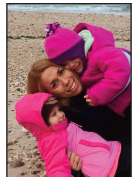
Being outside with my girls gives me the chance to connect with nature, with my kids, and believe it or not, with my mind.