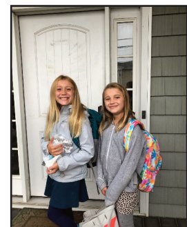
My girls take time to write to their relatives in other areas as well as their friends in Cape Cod. Not only is it fun to get mail, it's a great literacy activity!