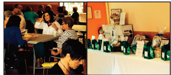
The room was filled with bridge players, ready to play for a chance to win an iPad.