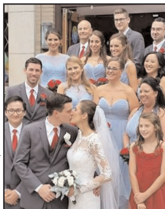
Pictured above, the bride and groom, surrounded by family and friends as they pause for a kiss outside the chapel.